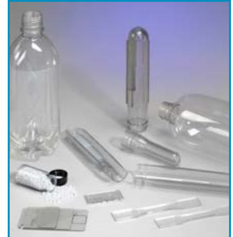
Full evaluation capabilities

Visit: www.plastictechnologies.com/analytical_lab