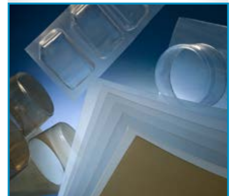
Small-quantity material evaluation